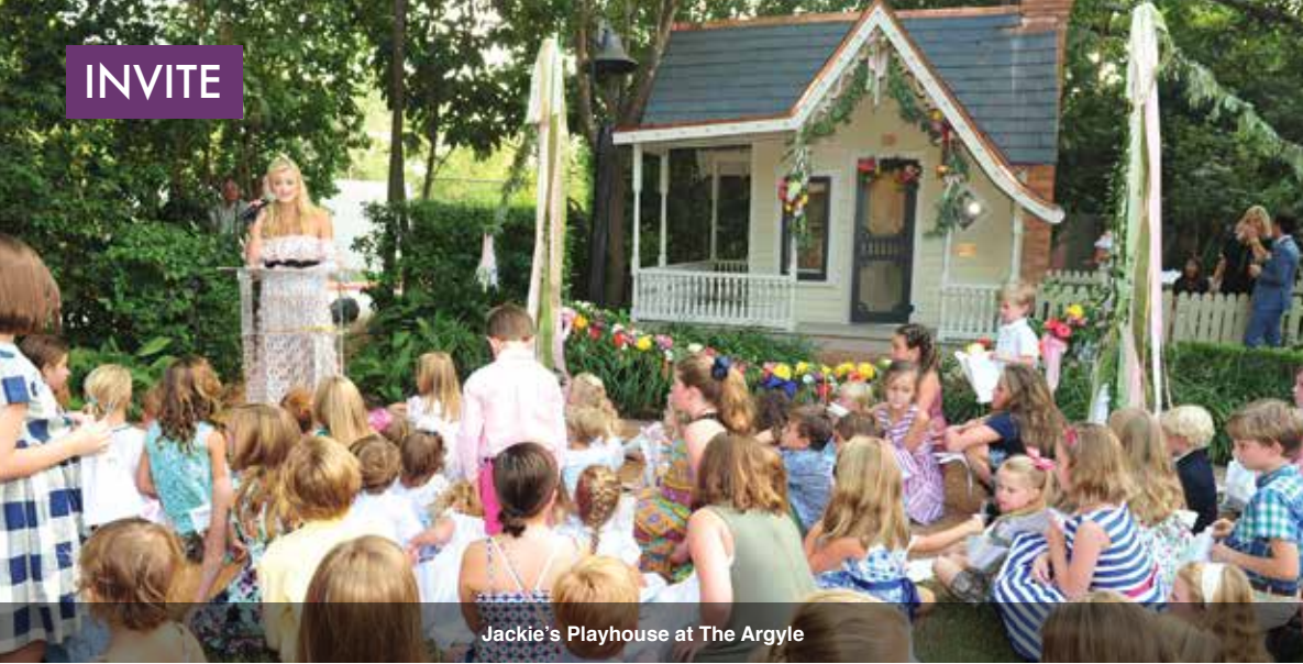
Jackie's Playhouse at The Argyle