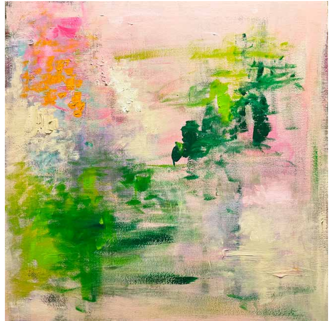
Citrus Bloom 36 x 36